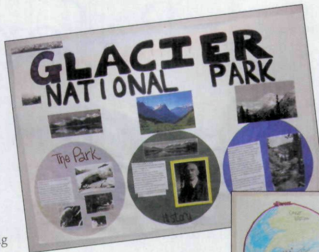
Middle school students prepared these posters in preparation for a whole-class presentation (left) and a discussion with a partner (right). The discussions deepened students' knowledge of the topics and prepared them to write their papers.

As the other students made their presentations, we followed the same pattern. Students warmed to their subjects and spoke more and more